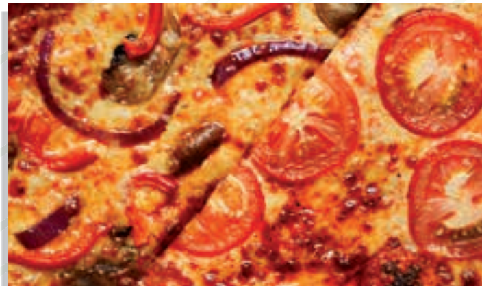
Dining In - New Menu

Please note that some of the activities listed in this guide may not be running during your break.