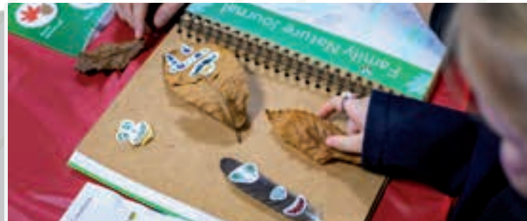
Family Nature Journal

⚠ Please refer to the Health and Safety Information and Advice in this leaflet before booking any activity.