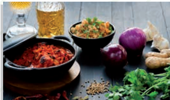
Rajinda Pradesh - New Menu