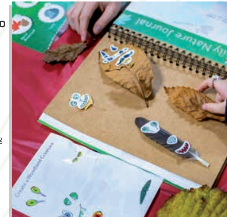
Family Nature Journal

Log in to your Center Parcs account to view an itinerary for you and your whole party.