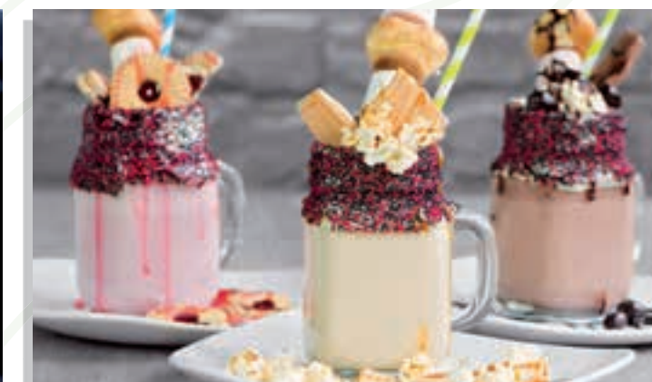
Huck's American Bar & Grill