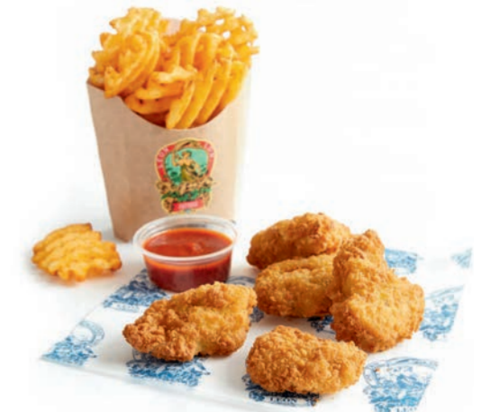
GFC & LEON BAKED FRIES