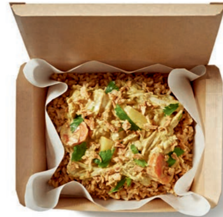
LEON X GIZZI THE TURKEY CURRY