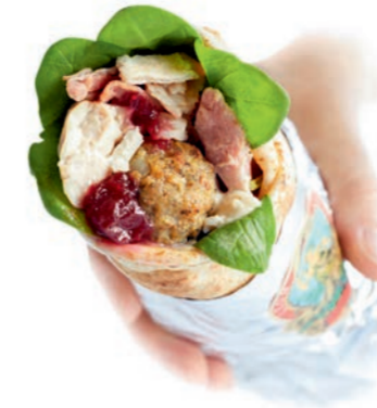
THE CHRISTMAS WRAP