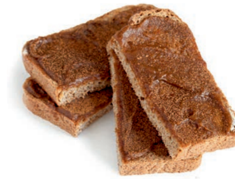
TOAST OF THE TOWN