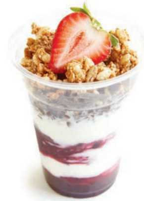
MEGAN'S YOGHURT SUNDAE