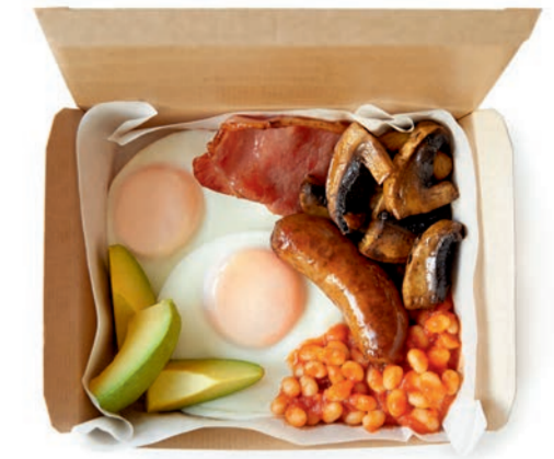
THE BIG BREAKFAST BOX