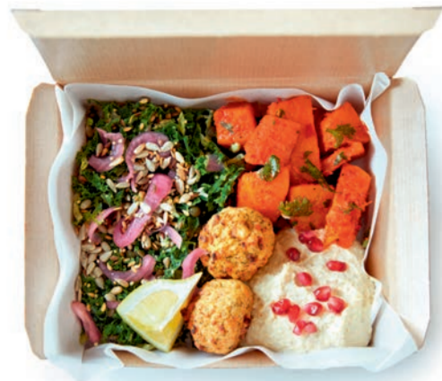
LEBANESE MEZZE SALAD