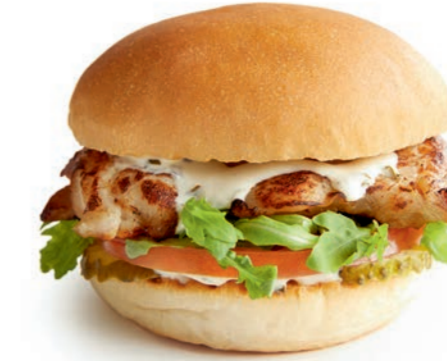
CHARGRILLED CHICKEN BURGER